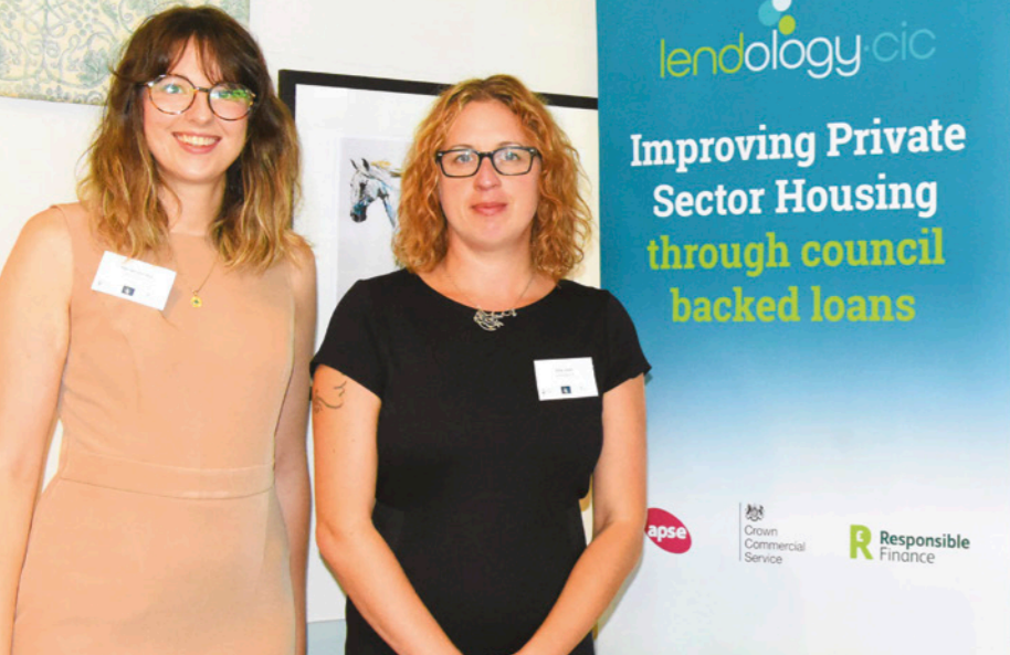
Bank of England annual update at Taunton Racecourse