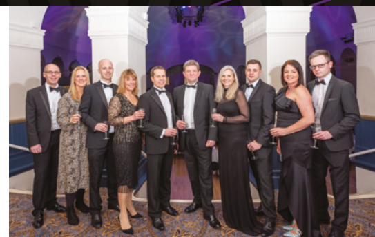
▲ Guests from main awards' sponsor Albert Goodman.