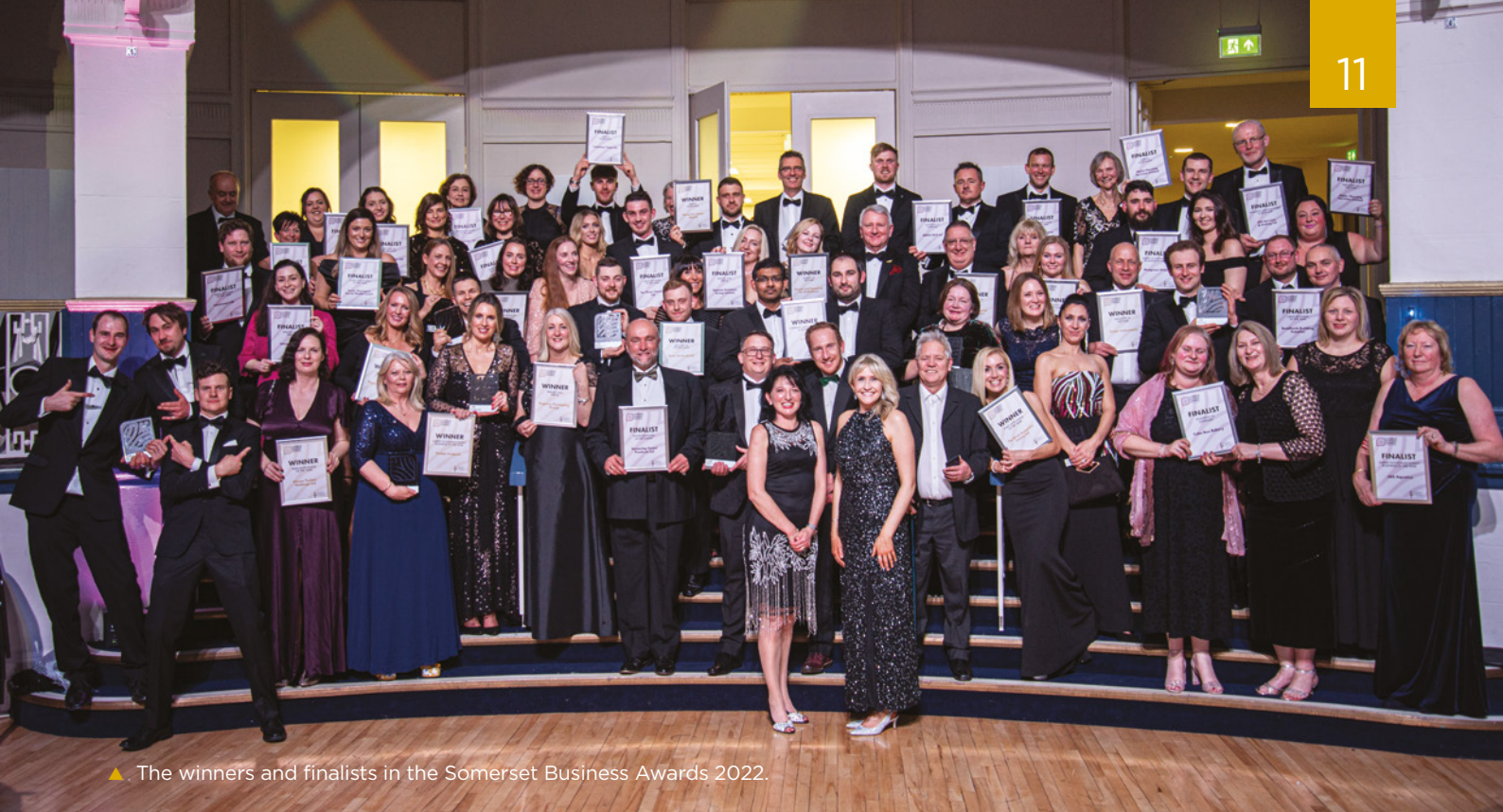
▲ The winners and finalists in the Somerset Business Awards 2022.