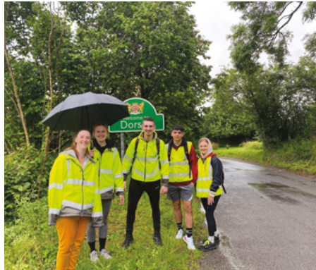
The team is pictured during a previous fundraising charity walk.

"I decided that this year I wanted to arrange a charity event that will make a difference which is why I chose litter picking. This is us giving back to the community and everyone in the area will benefit from it."